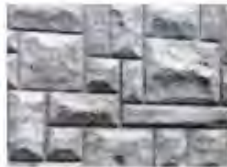
Ashlar Cut Stone