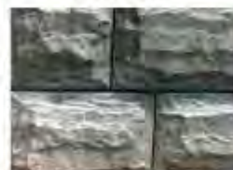
Split Faced Granite 24"