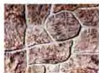
San Luis Obispo