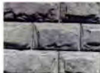
Split Faced Granite 12"